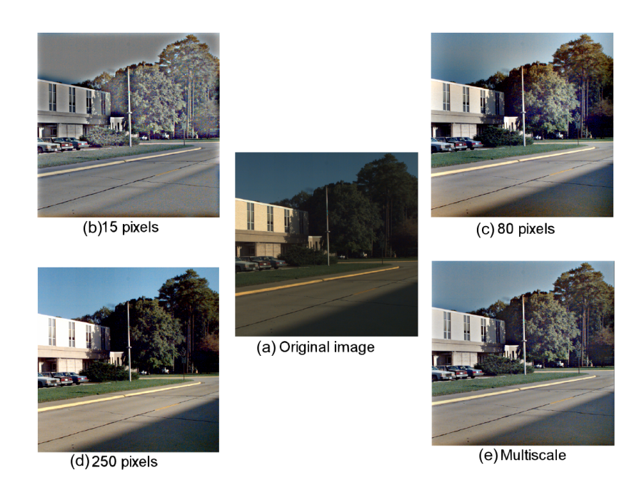
Figure 1. (a) The original input (b) Narrow surround (c) Medium surround (d) Wide surround (e) MSR output. The narrow-surround acts as a high-pass filter, capturing all the fine details in the image but at a severe loss of tonal information. The wide-surround captures all the fine tonal information but at the cost of dynamic range. The medium-surround captures both dynamic range and tonal information. The MSR is the average of the three renditions.

rendition for images with any degree of graying. In addition we would like for the correction to preserve a reasonable degree of color constancy since that is one of the basic motivations for the retinex. Color constancy is known to be imperfect in human visual perception, so some level of illuminant color dependency is acceptable provided it is much lower than the physical spectrophotometric variations. Ultimately this is a matter of image quality and color dependency is tolerable to the extent that the visual defect is not visually too strong.