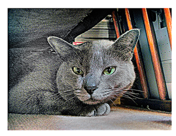
Figure 3: Continued: (c) Strong enhancements