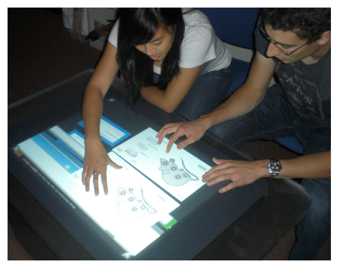
Figure 2: G-nome Surfer comparing gene ontology and expression data of different mouse genes.

provide empirical evidence for the feasibility and value of integrating reality-based creativity support environments in college-level science education as well as shed light on how users collaborate and solve problems using such environments in the context of college level inquiry-based learning [13].