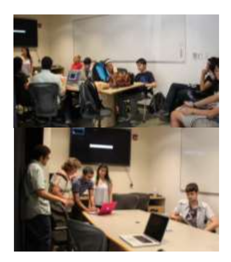
Figure 2: Observing data-driven research meetings.