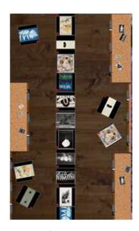
Figure 4: Interface components: a curatorial decision-making application with open drawers and a river.

Objects that are added to the drawer are automatically resized to a miniature representation, but can be resized and manipulated within the drawer. users can arrange objects in meaningful configurations as well as annotate them. Users can choose to use a personal device as their personal drawer (by dragging their drawer into a registered device). This is particularly useful when a higher resolution is required in order to examine particular information artifacts. This is often the case when scientific information is examined and discussed. Users can drag objects into and out of their device to add and remove objects from their drawer.