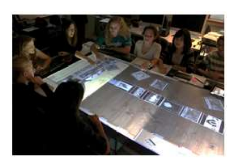
Figure 1: The Beast - a large-scale interactive tabletop.

digital world, thus they are often unified under the umbrella of Reality-Based Interfaces (RBIs) [9]. RBIs leverage users' social, spatial, and kinesthetic skills, thereby supporting collaboration while reducing the mental effort required to learn and operate a computational system.