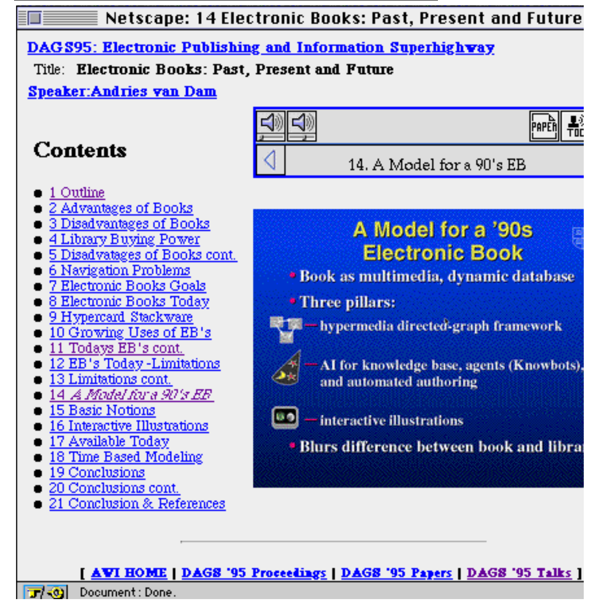
Figure 2 The DAGS95 Presentation Interface — a WWW/HTML based interface for presentations with audio and slides.

For presentations, the most significant drawback is insufficient support for multimedia synchronization. A complex interface requires synchronization to support the transition from slide to slide at key points in the audio, to animate the cursor (provided an animated cursor is used), and to scroll the transcription of the presentation in conjunction with audio from the presentation. Unfortunately, HTML was not designed with sufficient support for such multimedia synchronization. At present, the best solution seems to be to enforce synchronization by segmenting the audio and explicitly requiring to preload the next bit of audio upon opening the next slide.