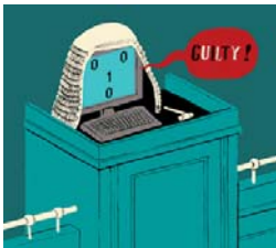
AI am the law The Economist