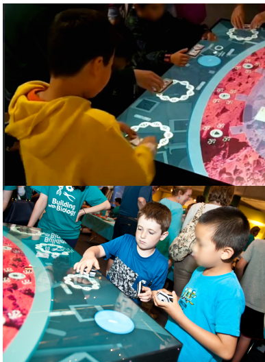
Figure 4. Children interact with the BacPack exhibit in a museum setting.

frameworks for learning with tabletop and tangible user interfaces [6]. We encountered several design challenges as we built our system: