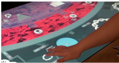
Figure 2. Visitors insert their custom designed DNA loop into a bacterium by dragging it over.