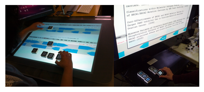
Figure 1: Horizontal experimental setup (left) - first generation Microsoft Surface and first generation Sifteo cubes. Vertical experimental setup (right) – second generation Microsoft Surface and first generation Sifteo cubes.

and egalitarian input [16, 23] and support distributed cognition by affording spreading, piling, and organizing information artifacts [3, 4]. Such affordances are well suited for sensemaking [37]. Research also indicates that tabletop interfaces support active reading [29] and promote reflection [44]. Considering these qualities of tabletop interaction, as well as other factors such as improving display quality, increasing availability, and falling prices of commercial hardware platforms, tabletop interfaces provide unique opportunities for learning and discovery with large and abstract data sets.