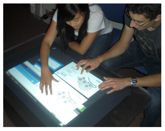
Figure 2: G-nome Surfer comparing gene ontology and expression data of different mouse genes.

provide empirical evidence for the feasibility and value of integrating reality-based creativity support environments in college-level science education as well as shed light on how users collaborate and solve problems using such environments in the context of college level inquiry-based learning [13].