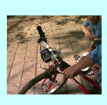
Programmable Brick attached to handlebars of Figure 4 Eric's bicycle

of students, while also connecting to important ideas from the science curriculum. As students built and programmed their LEGO creatures, they studied how "real" animals live and behave, and they applied their findings to their LEGO constructions.