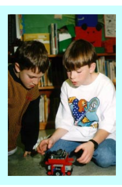
Figure 2 Fourth-grade students test the behaviors of their Programmable Brick "creature"

ties—so that it could connect to the interests and experiences of a wide variety of people. While some people might use the Brick to create their own scientific instruments, others might use it to create their own musical instruments.