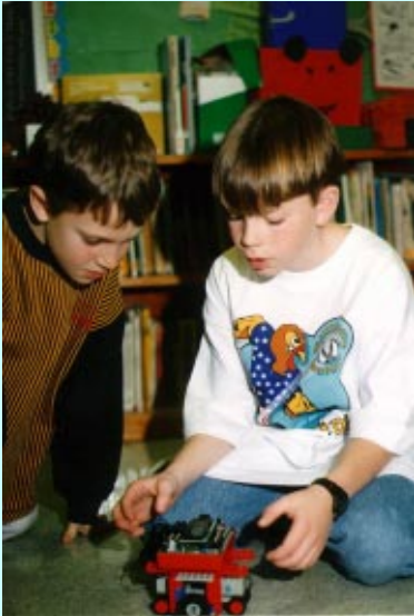
Figure 2 Fourth-grade students test the behaviors of their Programmable Brick “creature”

ties—so that it could connect to the interests and experiences of a wide variety of people. While some people might use the Brick to create their own scientific instruments, others might use it to create their own musical instruments.