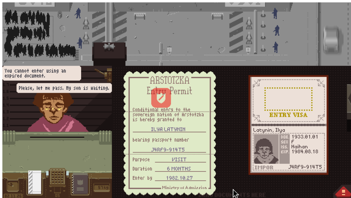
Figure 2. A screenshot from Papers, Please showing the interface as the player decides whether to admit a traveler. The traveler in question previously stated that she was coming to visit her son, who she has not seen in 6 years. Although her entry permit is slightly out-of-date, she is asking for leniency. At this point, the player must decide to either approve or deny her visa.

decision is complicated by the fact that the game also presents situations where applicants attempt to bribe or threaten the player, implying that not all of their claims can be taken at face value. This decision about the fate of an ostensible refugee (or similar person) embodies one of the central themes of the game: how the uncertainty of information from unreliable sources can be pitted against the certain plight of one's family to turn a moral dilemma into a choice with a reluctant "better" option. In the rest of this section, we show the results of each step of a choice poetic analysis (see Section 1) for the choice described in Figure 2.